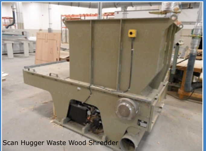
Scan Huger Waste Wood Shredder

JLG 3246 ES Pro-Lift Series aerial work platform, s/n 0200154366 (2006), battery-operated • JLG 1932 E2 aerial work platform, s/n 0200070086, battery-operated