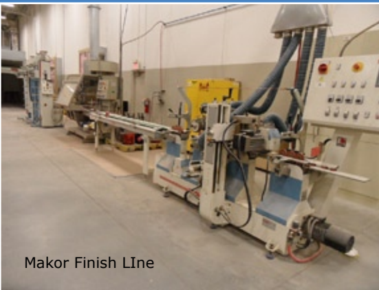
Makor Finish Line

(2) Col-Met EMD 26 SB spray booths, 14'x26'x9'H ID, 15'x26'x11'H OD, 9'x9' opening (doors)