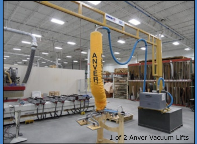
1 of 2 Anver Vacuum Lifts