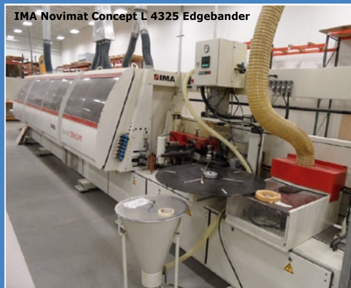
IMA Novimat Concept L 4325 Edgebander