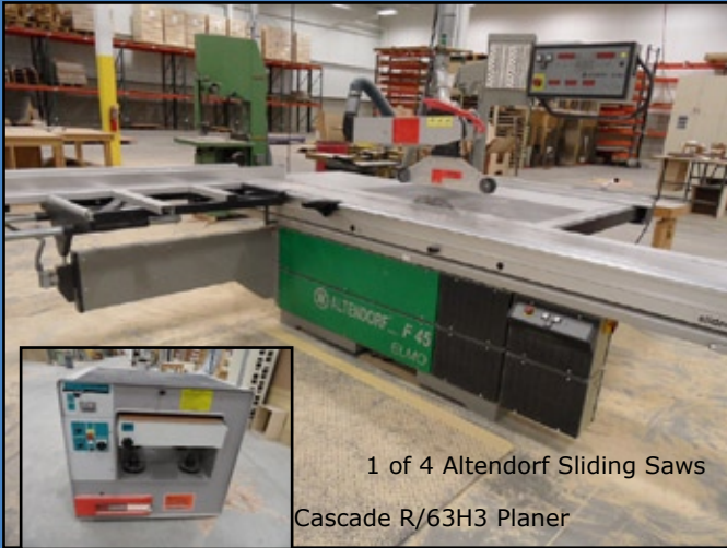
1 of 4 Altendorf Sliding Saws Cascade R/63H3 Planer

WEDNESDAY • JUNE 8 STARTING AT 10:00 A.M.