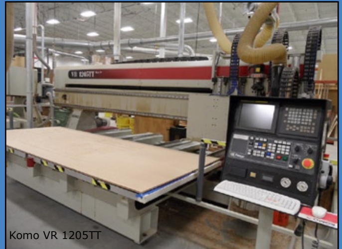
Komo VR 1205TT

Busellato CNC router, Model Jet 1250, s/n 4368 (1998)