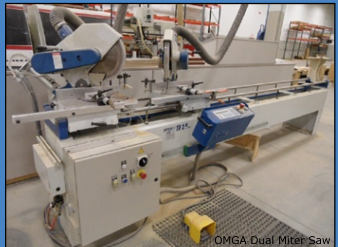
OMGA Dual Miter Saw