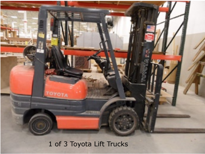
1 of 3 Toyota Lift Trucks

Baghouse Dust Collection System - 2002 New York blower, 100 hp 34,000 cfm fan, large bag house w/ 24-valve air pulse, bottom discharge auger, clamp-type duct work w/ 2002 Ecogate Power Master EG1100 & Ecogate GreenBox Master EG102 computerized gate system (30 motorized gates), Flamex FMZ4100 GAB6 Minimax spark detection system.