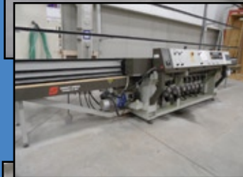
Schiatti Angelo Glass Edger