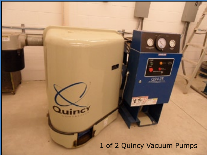
1 of 2 Quincy Vacuum Pumps