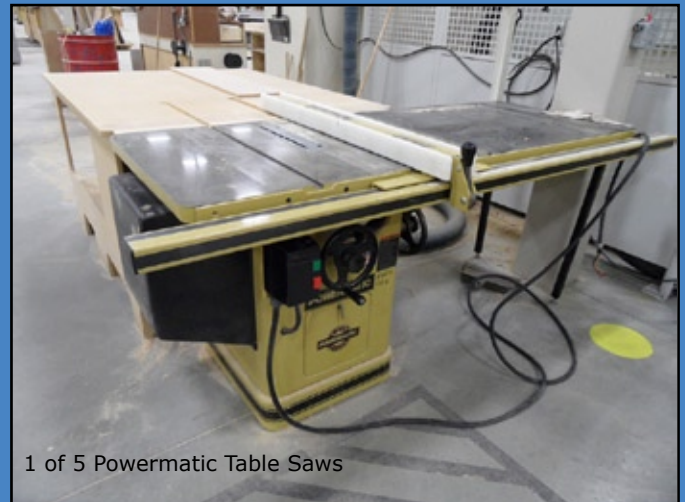
1 of 5 Powermatic Table Saws

Cascade Shark sliding table saw, s/n 02-K1-071 (2002)