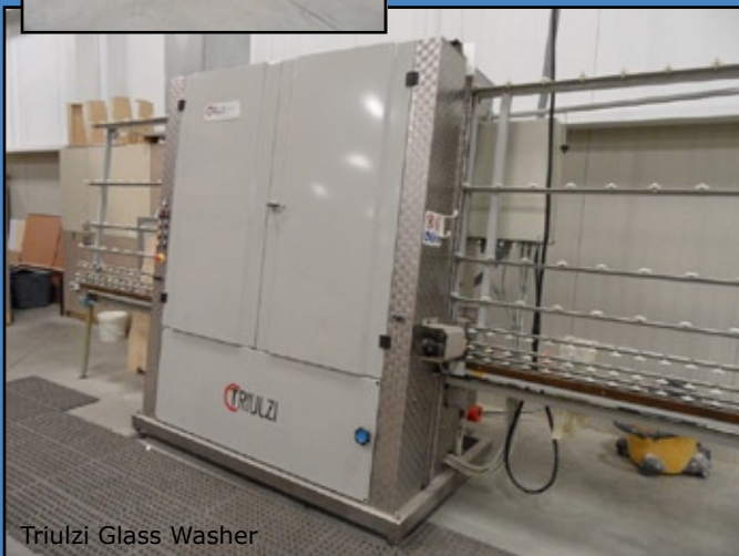
Triulzi Glass Washer