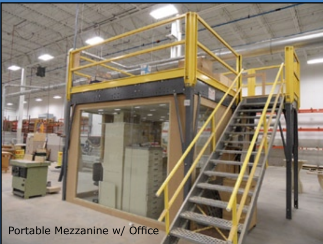
Portable Mezzanine w/ Office