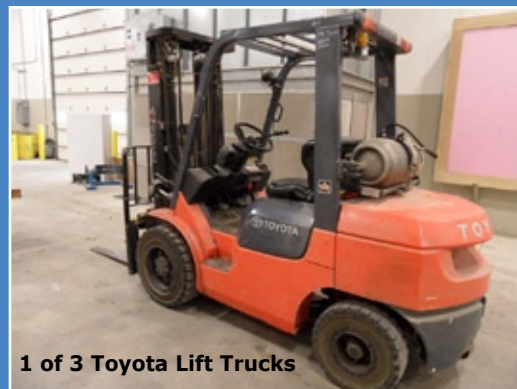
1 of 3 Toyota Lift Trucks