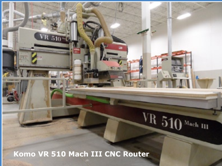
Komo VR 510 Mach III CNC Router

By Order of Secured Party - Business Closed