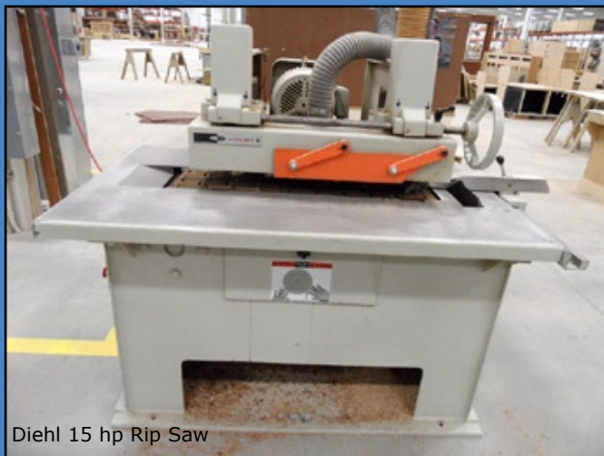
Diehl 15 hp Rip Saw