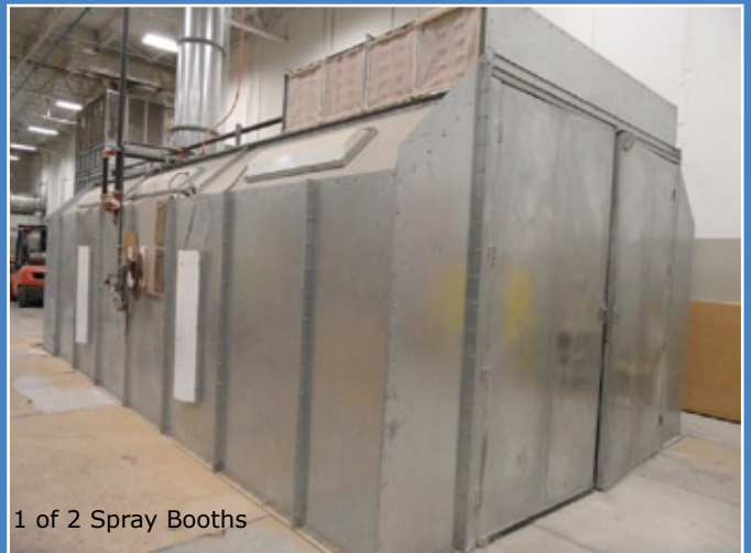
1 of 2 Spray Booths