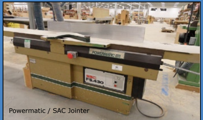
Powermatic / SAC Jointer