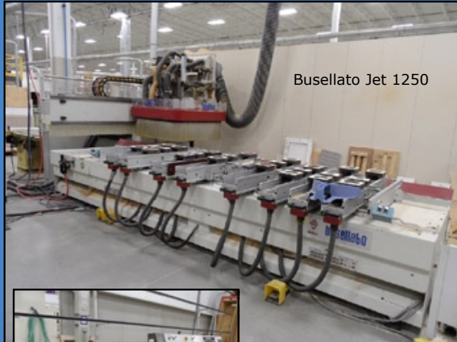
Busellato Jet 1250