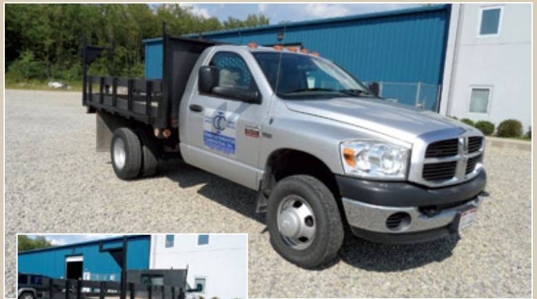
2007 Dodge Ram 3500HD

1995 Ford / Wayne school bus, VIN: 1FDNB80C6SVA19677