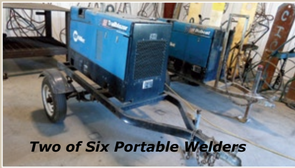
Two of Six Portable Welders