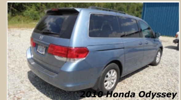
2010 Honda Odyssey