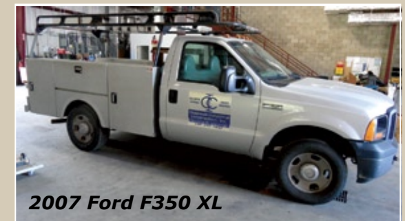
2007 Ford F350 XL