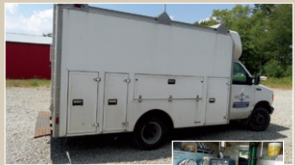
2004 Ford Welding Truck

Cub Cadet LT1046 lawn tractor, hyd. drive, 76 hrs.. on meter