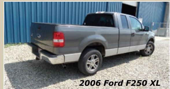
2006 Ford F250 XL