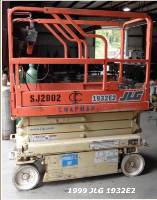
1999 JLG 1932E2