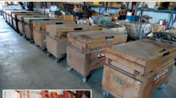
Partial View of (18) Job Boxes (28) Ladders