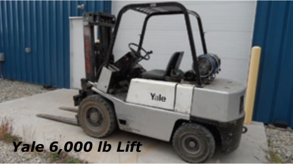
Yale 6,000 lb Lift