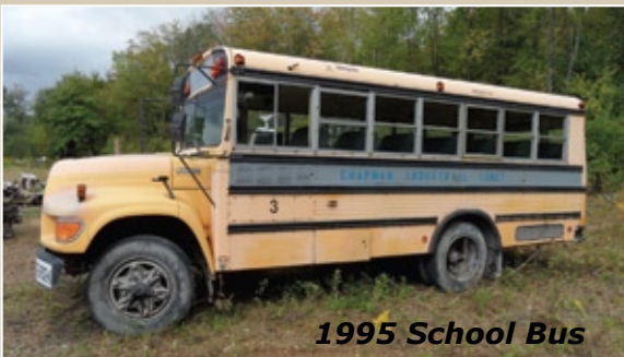
1995 School Bus

PAYMENT TERMS: Payment in full upon conclusion of auction by cash or in-state business check. Buyers outside Ohio paying by business check must provide a current bank letter guaranteeing payment to Bambeck Auctioneers Inc.